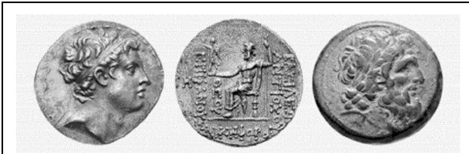
The images on the coins above illustrate the official metamorphosis of Antiochus IV into a deity. The face of the first (a silver tetradrachma) bears the clean-shaven likeness of the king wearing the royal diadem. The reverse side portrays an enthroned bearded Zeus with scepter in his left hand & the figure of winged Victory (Greek: Nike) in his outstretched right hand (a slight modification of the mythical motif on the back of coins of Alexander the Great). The inscription (with top at left edge) reads: Basileos Antiochou, (continuing to left of throne) Theou Epiphaniou (concluding at bottom) Nikephorou ["of King Antiochus, God Manifest, Victory bearer"]. The face of the bronze coin at the right portrays a bearded Antiochus as Zeus laureate himself, wearing the victor's wreath. The reverse side (not shown) identifies the image: "of King Antiochus, God Manifest." Both coins were minted in Antioch.